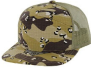
DESERT CAMO/KHAKI *RSCT