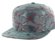
TEAL BURGUNDY CAMO