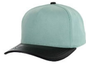
LIGHT BLUE/BLACK PU