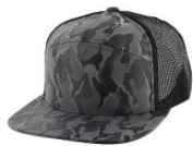
CHARCOAL CAMO / BLACK