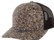
DESERT DIGI CAMO/BROWN *DCT