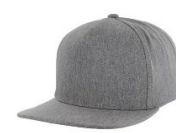
MELANGE 'NEW' HEATHER GRAY