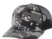
BLACK CAMO/BLACK *RSCT *RSCT