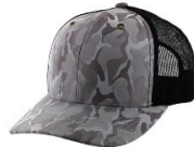
LIGHT GREY CAMO /BLACK