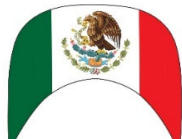
BLACK (6 PANEL)