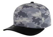
BLACK CAMO/BLACK PU