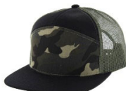
WASHED COTTON GREEN CAMO(#9) / BLACK / OLIVE