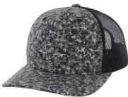
BLACK DIGI CAMO/BALCK *DCT