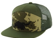
FOREST DIGI CAMO / OLIVE/OLIVE