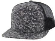
BLACK DIGI CAMO/BALCK *DCT