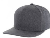
MELANGE 'NEW' HEATHER CHARCOAL