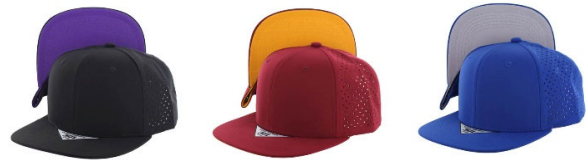
BLACK(PURPLE) BURGUNDY (GOLD) ROYAL(LIGHT GREY)

5 PANEL, FLAT BILL VISOR ONE SIZE FITS MOST