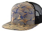
KHAKI BLUE CAMO/BLACK