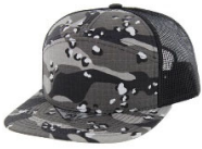
BLACK CAMO/BLACK *RSCT