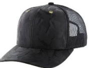
BLACK CAMO/ BLACK