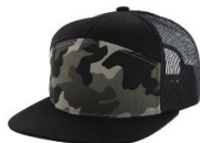
BLACK CAMO(#8) / BLACK/BLACK