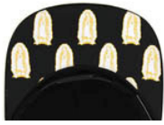
ETI-21-3 VIRGEN (MULTI)