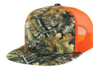
HUNTING CAMO/N.ORANGEOLIVE CAMO(T)/BLACK