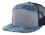
H.GRY/COBALT CAMO /NAVY