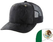
BLACK CAMO/BLACK (MEXICAN FLAG) K815NCTUP