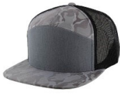
H.GRY / L.GRY CAMO /BLACK