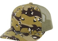
DESERT CAMO/KHAKI *RSCT