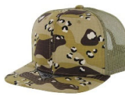
DESERT CAMO/KHAKI *RSCT