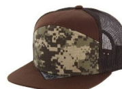
DK DESERT CAMO / BROWN/BROWN