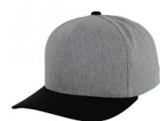
MELANGE HEATHER GRAY/BLACK