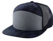
H.GRY / NAVY CAMO /NAVY