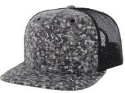
BLACK DIGI CAMO/BALCK *DCT