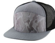
LIGHT GREY CAMO/H.GREY/BLACK