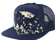
NAVY DIGI CAMO / NAVY/NAVY