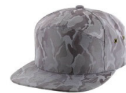
LIGHT GRAY CAMO