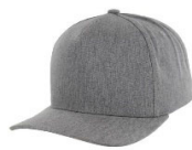
MELANGE HEATHER GRAY