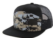
BLACK DIGI CAMO / BLACK/BLACK