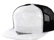
WHITE CAMO/BLACK /BLACK