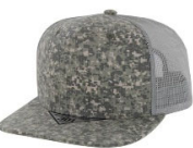
ACU DIGI CAMO/L.GREY *DCT