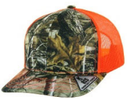
HUNTING CAMO/NEON ORANGE