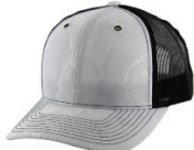
WHITE CAMO / BLACK