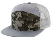
ACU DIGI CAMO / H.GRY/L.GREY