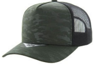
DARK GREEN CAMO