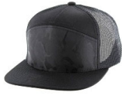
BLACK CAMO /BLACK/BLACK