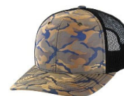
KHAKI BLUE CAMO/BLACK