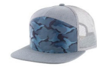
COBALT CAMO /H.GREY/L.GREY