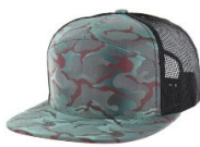
TEAL BURGUNDY CAMO /BLACK