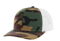
GREEN CAMO(T) /WHITE