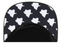
ETI-18-4 DURANGO (MULTI)