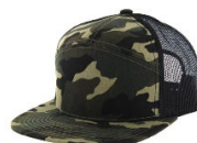
WASHED COTTON GREEN CAMO(#9) /BLACK