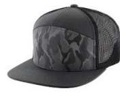
CHARCOAL CAMO /CHARCOAL/BLACK