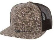
DESERT DIGI CAMO/BROWN *DCT