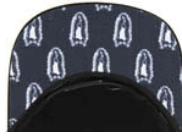
ETI-21-4 VIRGEN (MULTI)