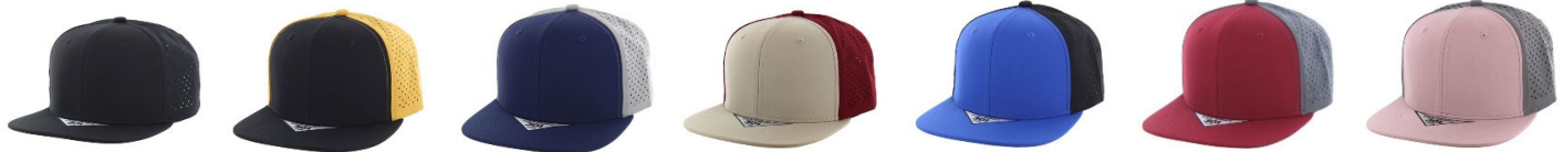
BLACK BLACK/GOLD NAVY/LIGHT GRAY KHAKI/BURGUNDY ROYAL/BLACK BURGUNDY/CHARCOAL PINK/LIGHT GRAY

6 PANEL, FLAT BILL VISOR ONE SIZE FITS MOST