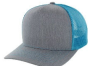
HEATHER GRAY /NEON BLUE