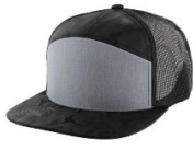
H.GRAY/BLACK CAMO /BLACK