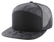
BLACK /BLACK CAMO/BLACK