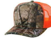
HUNTING CAMO /NEON ORANGE