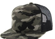
WASHED COTTON BLACK CAMO(#8) / BLACK