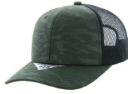
DARK GREEN CAMO