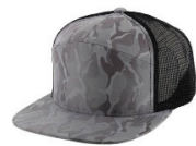
LIGHT GRAY CAMO / BLACK