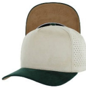
BEIGE/DARK GREEN (KHAKI)