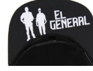
ETI-25-2 EL GENERAL