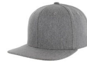
MELANGE 'NEW' HEATHER GRAY