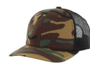
GREEN CAMO(T) /BLACK