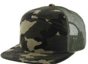
WASHED COTTON GREEN CAMO(#9) / OLIVE