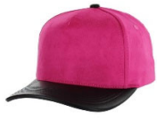
HOT PINK/BLACK PU