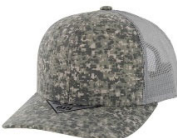
ACU DIGI CAMO/L.GREY *DCT