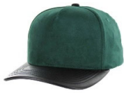
DARK GREEN/BLACK PU