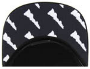
ETI-16-2 SINALOA (MULTI)