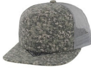
ACU DIGI CAMO/L.GREY *DCT