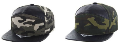
BLACK CAMO/BLACK PU/BLACK CAMO