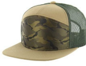
OLIVE CAMO / KHAKI/OLIVE KHAKI BLUE CAMO / HEATHER GRAY/GRAY