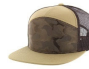
BROWN CAMO /KHAI/BROWN