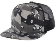
BLACK CAMO/BLACK *RSCT