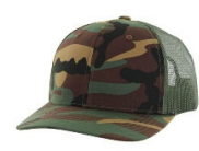
GREEN CAMO(T) /OLIVE