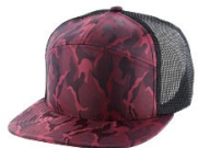
BURGUNDY CAMO /BLACK