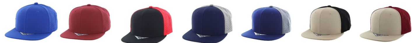
ROYAL BURGUNDY BLACK/RED NAVY/GRAY NAVY/CHARCOAL KHAKI/BLACK KHAKI/BURGUNDY

6 PANEL, FLAT BILL VISOR ONE SIZE FITS MOST