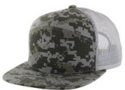
ACU DIGI CAMO /L.GREY