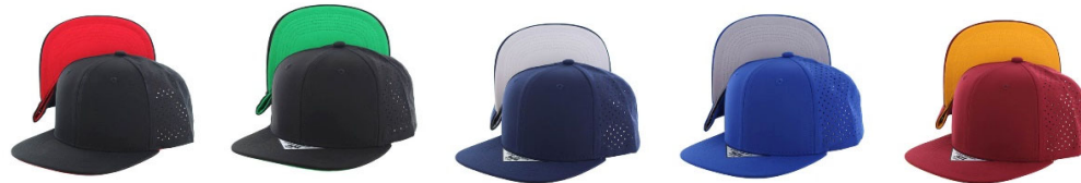
BLACK(RED) BLACK(KELLY GREEN) NAVY(LIGHT GRAY) ROYAL(LIGHT GREY) BURGUNDY (GOLD)

6 PANEL, FLAT BILL VISOR ONE SIZE FITS MOST