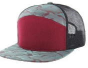
BURGUNDY /TEAL BURGUDY CAMO /BLACK