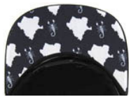
ETI-19DURANGO Y ALACRÁN