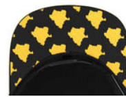
ETI-18-3 DURANGO (MULTI)