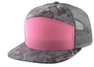
H.PK/L.GREY CAMO / GRY /L.GREY