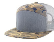
H.GRY/ KHAKI BLUE CAMO /L.GREY