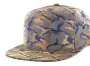
KHAKI BLUE CAMO