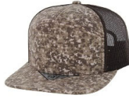
DESERT DIGI CAMO/BROWN *DCT